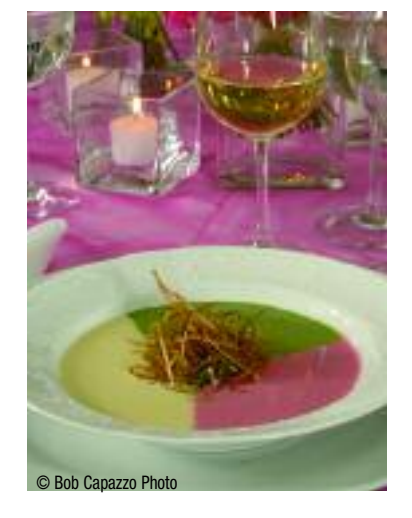
At Wainwright House, you will meet in gracious rooms and dine from an epicurean menu that pleases the eye as well as the palate.